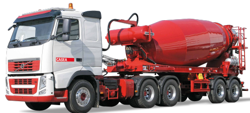
Truck mixer floating screed on the basis of binder compounds with extended setting

The CASEA binder compounds for truck mixers are formulated by us in a system- and aggregate-specific manner. In the mixing plant, you only add water and the suitable aggregate. If the aggregates are used correctly, you can achieve all screed strength classes with only one binder compound.